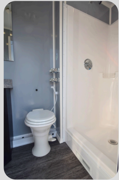
Grey Silk Interior

The SWT246 Six-Station Combo Trailer features private rooms, each equipped with a locking door, shower, toilet, and sink. This versatile trailer is ideal for events needing multiple restrooms or showers, offering both options in one convenient unit for maximum adaptability.