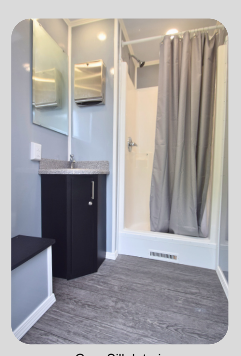
Grey Silk Interior

Curb Weight: 5,620lbs Axles: Single Box Length: 12.5-Feet Box Width: 100-Inches Opt. Fresh Tank:150/200 Gallons Waste Tank: 350 Gallons