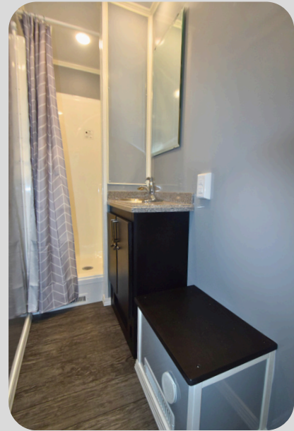
Grey Silk Interior

This durable trailer features easy-clean fiberglass stalls, waterproof walls, and non-slip flooring. Water-conserving shower heads and a large wastewater tank maximize efficiency, making it ideal for industrial sites, sports events, disaster relief, and remote locations needing mobile showers.